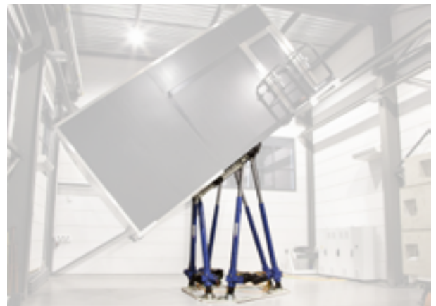
DCNS uses SIROCCO hexapods as submarine simulators for training purposes to reproduce the emergency situations that submarine crews might encounter during a mission.

GTT designs cryogenic membrane containment systems used in the shipbuilding industry for the transport of liquid natural gas (LNG). SIROCCO hexapod allows GTT laboratories to study the impact of moving liquid, also called sloshing, on their insulation.