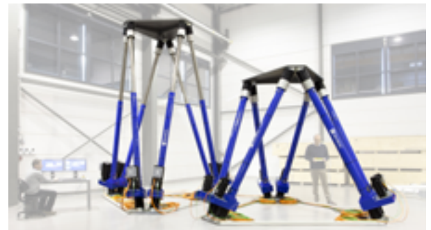
FMC Technologies uses two SIROCCO XL hexapods to test a 1/4 scale LNG loading arm. These hexapods simulate the swell motion to qualify the loading arm that will connect a gas carrier to an offshore gas production factory. One hexapod simulates the gas carrier, the other the offshore factory.